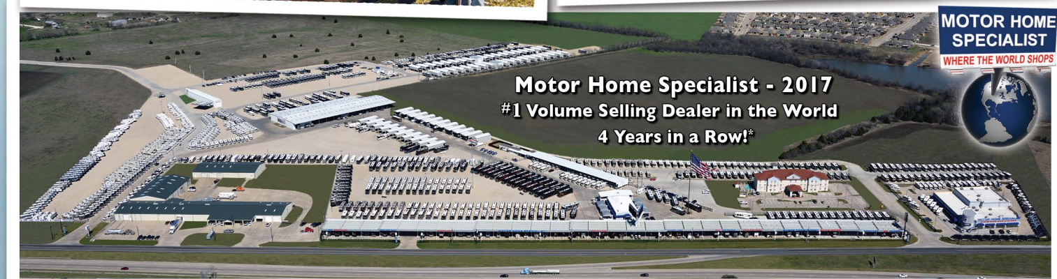
Motor Home Specialist - 2017 #1 Volume Selling Dealer in the World 4 Years in a Row!*

MOTOR HOME SPECIALIST WHERE THE WORLD SHOPS