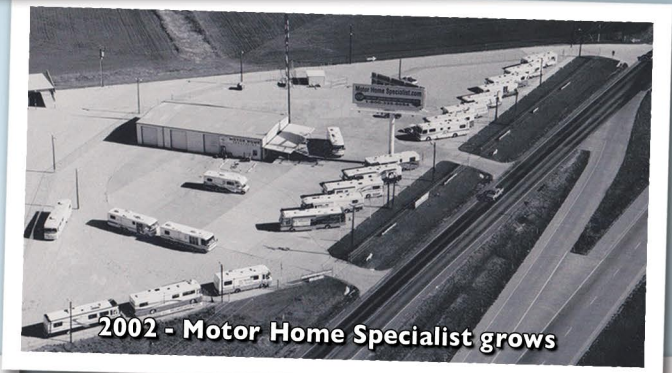
2002 - Motor Home Specialist grows