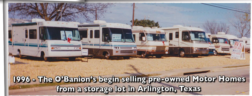
1996 - The O'Banion's begin selling pre-owned Motor Homes from a storage lot in Arlington, Texas