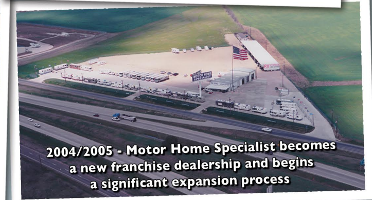
2004/2005 - Motor Home Specialist becomes a new franchise dealership and begins a significant expansion process