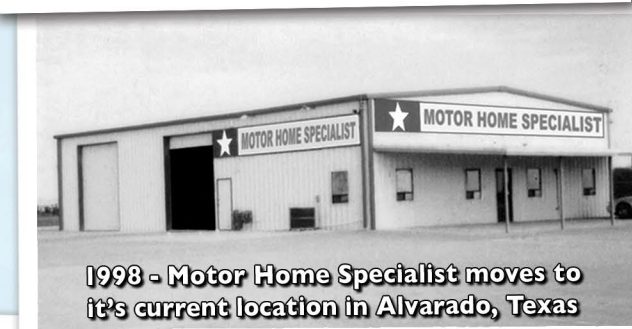
1998 - Motor Home Specialist moves to its current location in Alvarado, Texas