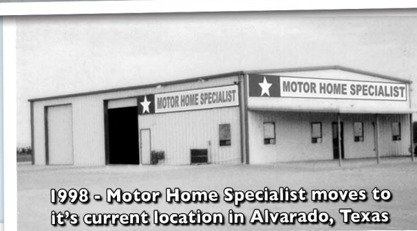
1998 - Motor Home Specialist moves to its current location in Alvarado, Texas