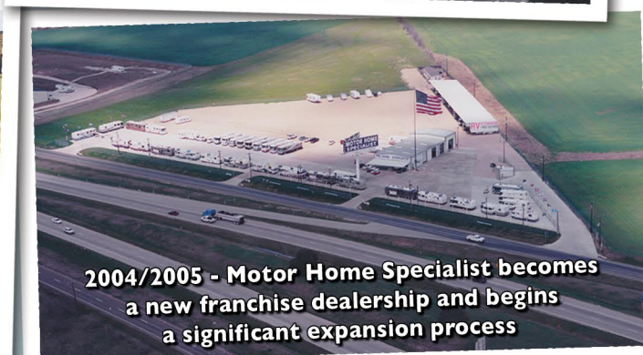
2004/2005 - Motor Home Specialist becomes a new franchise dealership and begins a significant expansion process