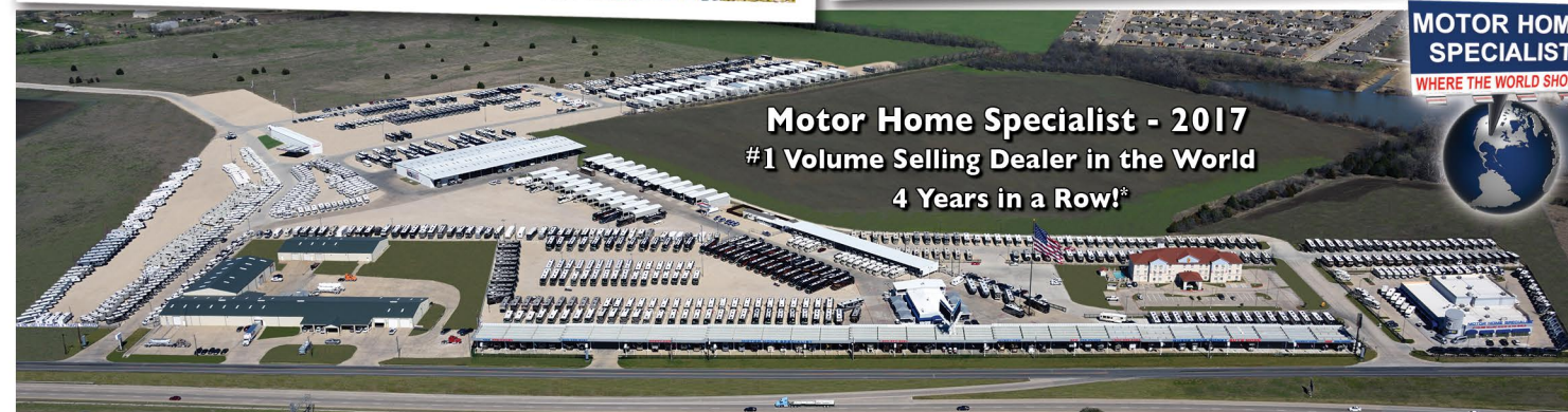
Motor Home Specialist - 2017 #1 Volume Selling Dealer in the World 4 Years in a Row!*

MOTOR HOME SPECIALIST WHERE THE WORLD SHOPS