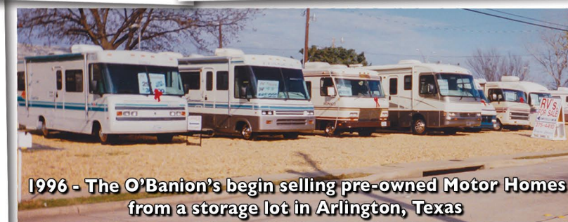
1996 - The O'Banion's begin selling pre-owned Motor Homes from a storage lot in Arlington, Texas